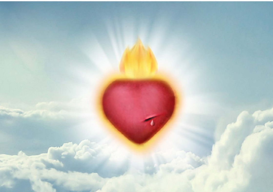
Sacred Heart of Jesus